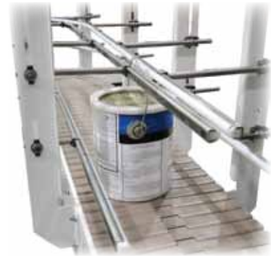
UHMW adjustable guides

THE APPLICATION: Conveying Pails into a Labeling Unit and Maintaining Product Orientation