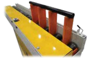
Four arm lift device and pop-up end stop

THE APPLICATION: Feeding Cut Pieces of Bar to Gantry